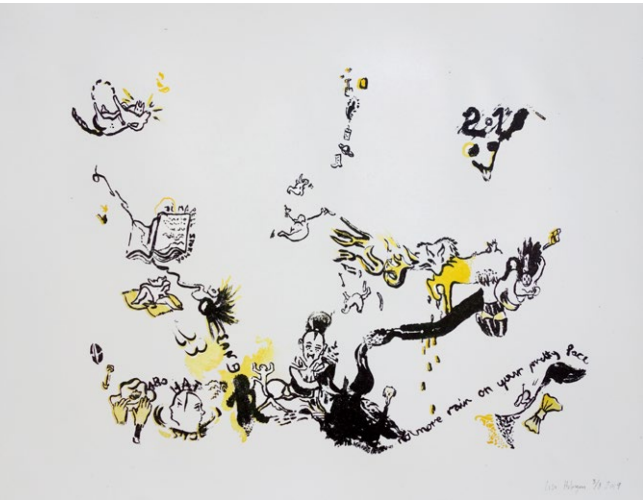
No More Rain on Your Pretty Face 39 x 48 cm, edition of 6, 2019