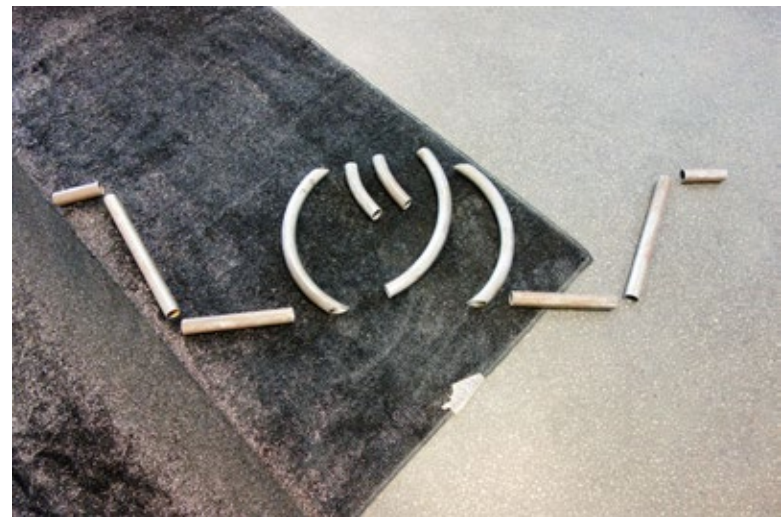
Untitled Bent metal tubes, size variable, 2016