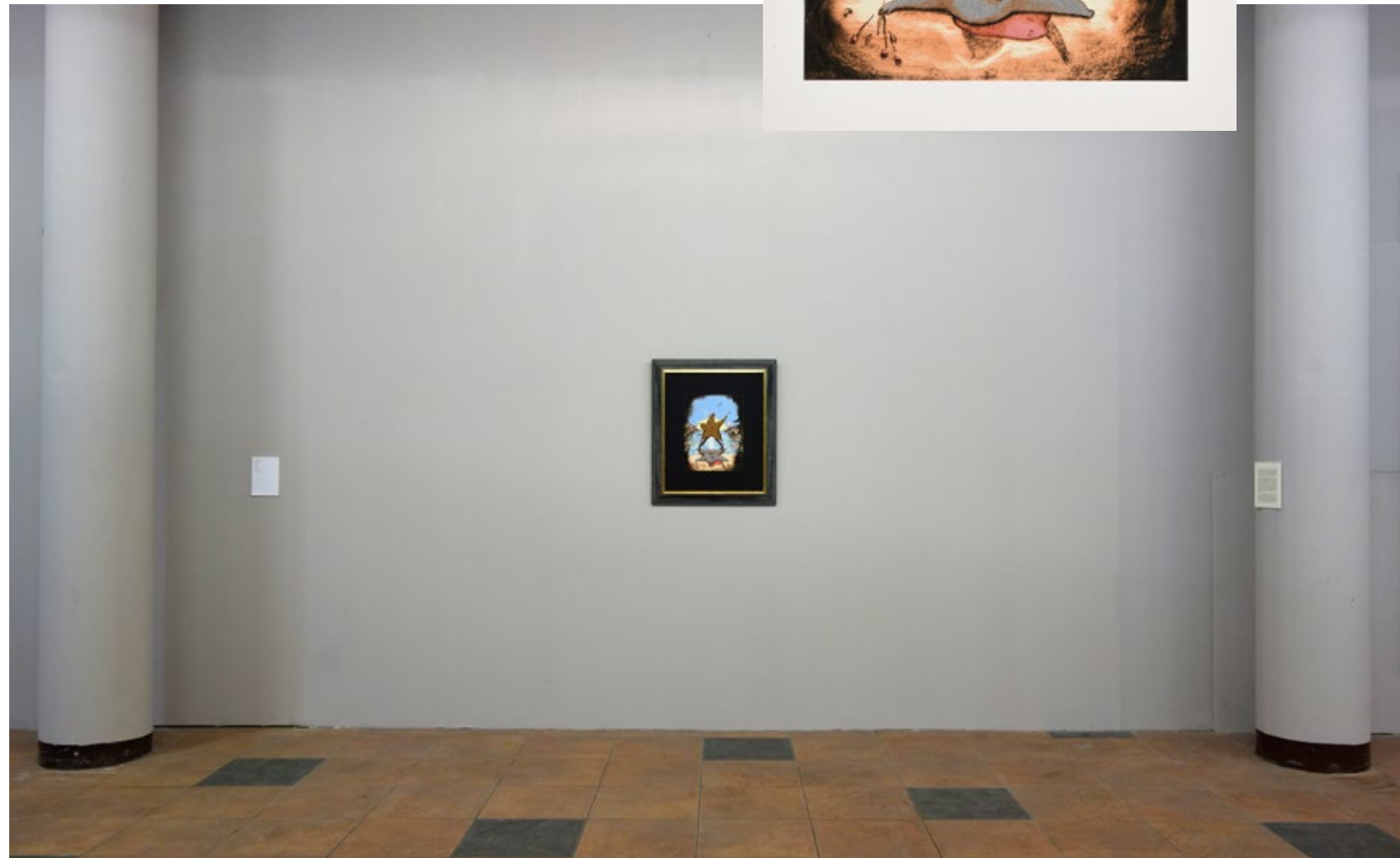
Sternchen von Hintern 10-color lithography, 2017 Installation view at SEZ, Berlin Previous page: Sternchen von Hintern bronze, 2017, 22 x 12 x 10 cm