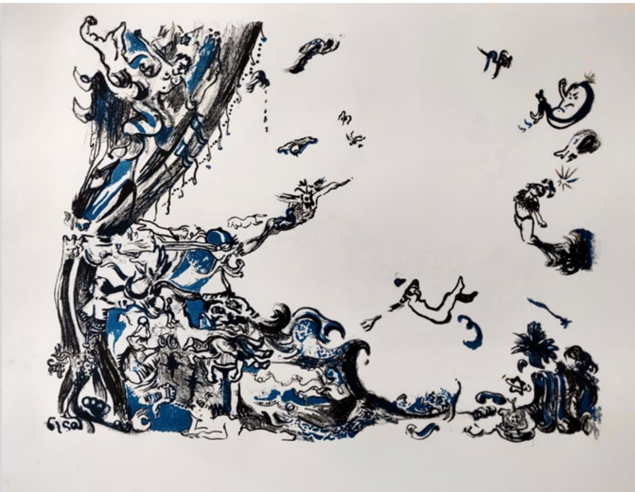
Blue Waves 39 x 48 cm, edition of 6, 2019